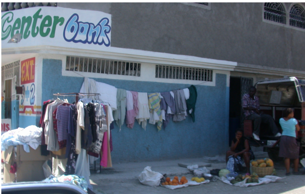
Entrepreneurship - Haitian Style

If we have anything to say about it, the answer is yes!